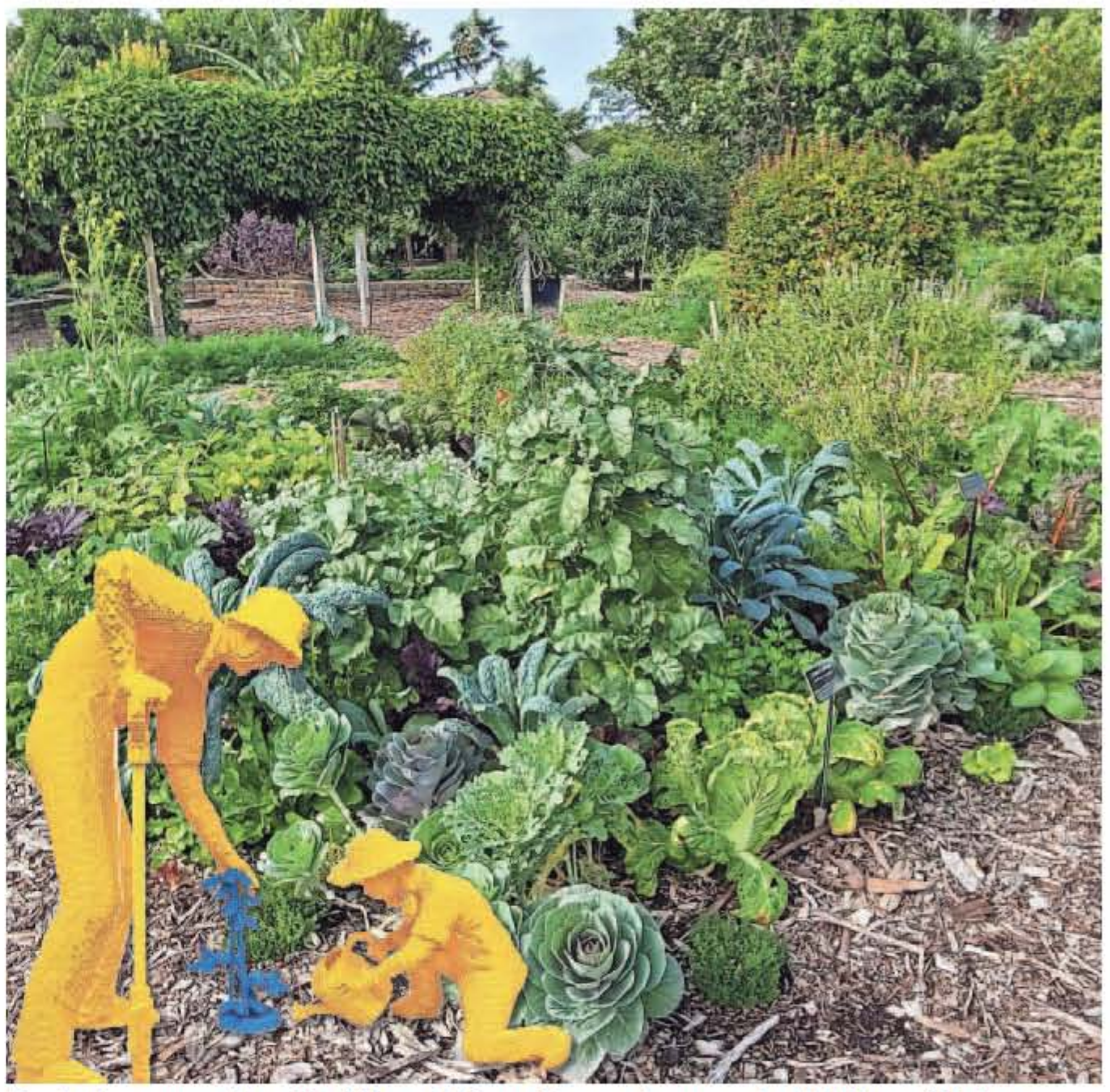
Featuring more than 40 different, Sean Kenney's newest exhibition, "Nature POP!" opens Saturday and runs through May 1 at Mounts Botanical Garden in West Palm Beach.